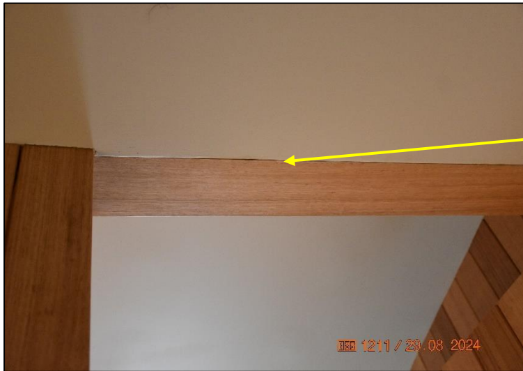
Photo No 19 shows a timber infill between two sections of ceiling in the hall.