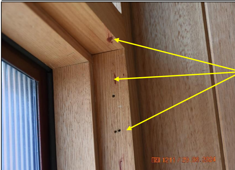
Photo No 20 shows a section of window frame in the bathroom.